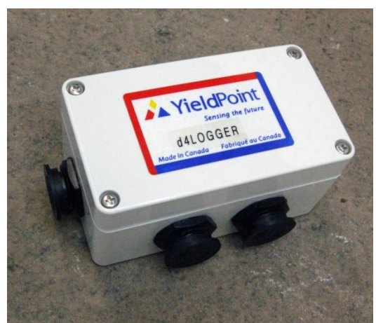
The d<sup>1</sup>LOGGER and d<sup>4</sup>LOGGER