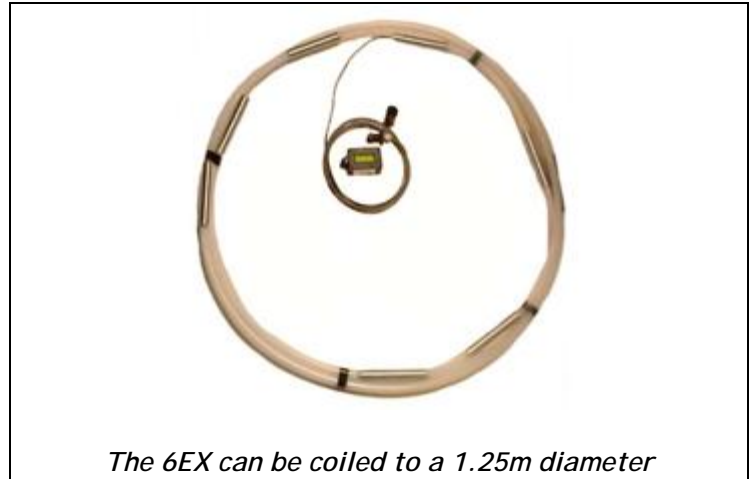
The 6EX can be coiled to a 1.25m diameter

The inherently digital nature of the signals eliminates the necessity for expensive analog-to-digital conversion and results in low cost readout unit that reads data directly in real world units (mm and °C). The sensor output is a 1-wire frequency modulated (CMOS and TTL compatible) digital signal which can be read by a low cost electronic meter or tachometer, and can be routinely interfaced with digital channels on PLCs. The signals themselves are robust (0-5V square waves) can be transmitted over 1000ft of lead-wire, and if broken the lead-wire can be twisted and taped together. Frequency modulation is widely recognized as preferable for the harsh mining environment where amplitude signals are prone to inaccuracies. Both the resolution (<0.01mm) and accuracy (<0.50%) are an order of magnitude better than for similarly priced alternatives. The single rod design that avoids the translation results in a further enhancement of the instrument's accuracy.