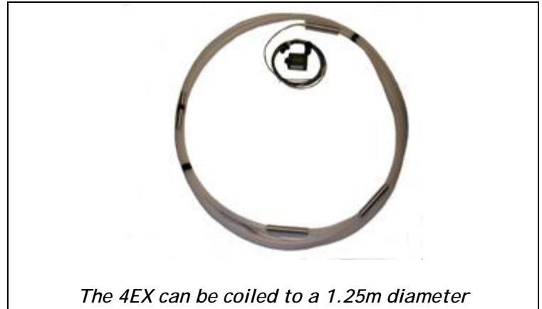
The 4EX can be coiled to a 1.25m diameter

The inherently digital nature of the signals eliminates the necessity for expensive analog-to-digital conversion and results in low cost readout unit that reads data directly in real world units (mm and °C). The sensor output is a 1-wire frequency modulated (CMOS and TTL compatible) digital signal which can be read by a low cost electronic meter or tachometer, and can be routinely interfaced with digital channels on PLCs. The signals themselves are robust (0-5V square waves) can be transmitted over 1000ft of lead-wire, and if broken the lead-wire can be twisted and taped together. Frequency modulation is widely recognized as preferable for the harsh mining environment where amplitude signals are prone to inaccuracies. Both the resolution (<0.01mm) and accuracy (<0.50%) are an order of magnitude better than for similarly priced alternatives. An on-board digital temperature sensor provides accurate compensation ( T_c=0.01\%FS/^\circ C over 0-50°C).